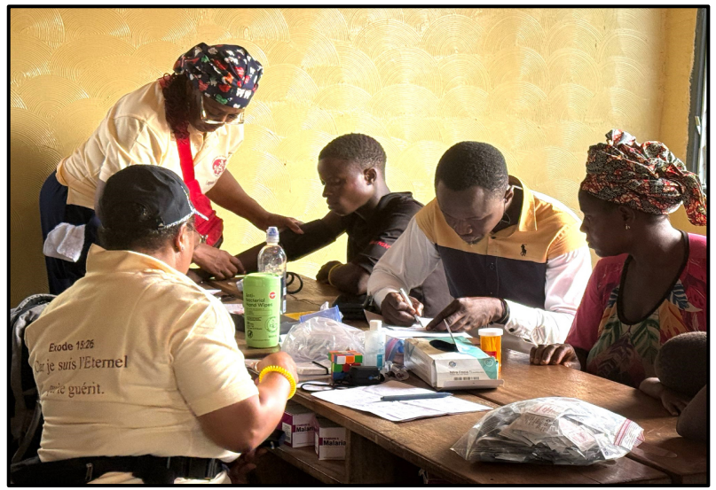
Medical Team Benin Village

During this past trip to Benin with a team, what stands out most is the incredible team I had the privilege to serve alongside. Together, we faced challenge after challenge—two days of airline delays in the middle of travel, bouts of sickness, and roads so rough they tested our endurance. Yet through it all, there was never a shortage of smiles, songs of praise, and unwavering faith. In three different villages, we set up mini medical clinics, doing our best to meet the overwhelming needs before us. And though the needs were far greater than we had prepared for, God showed up and met the needs.